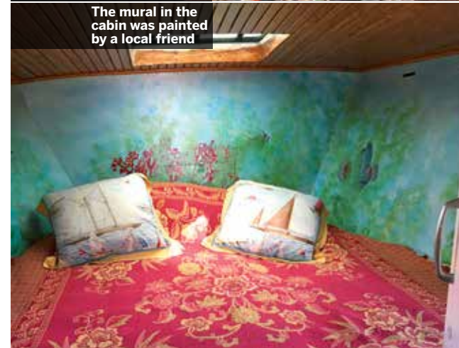
The mural in the cabin was painted by a local friend