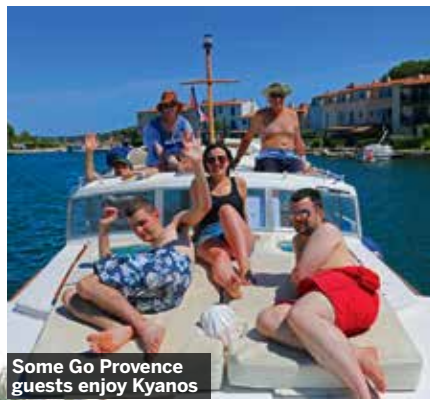
Some Go Provence guests enjoy Kyanos