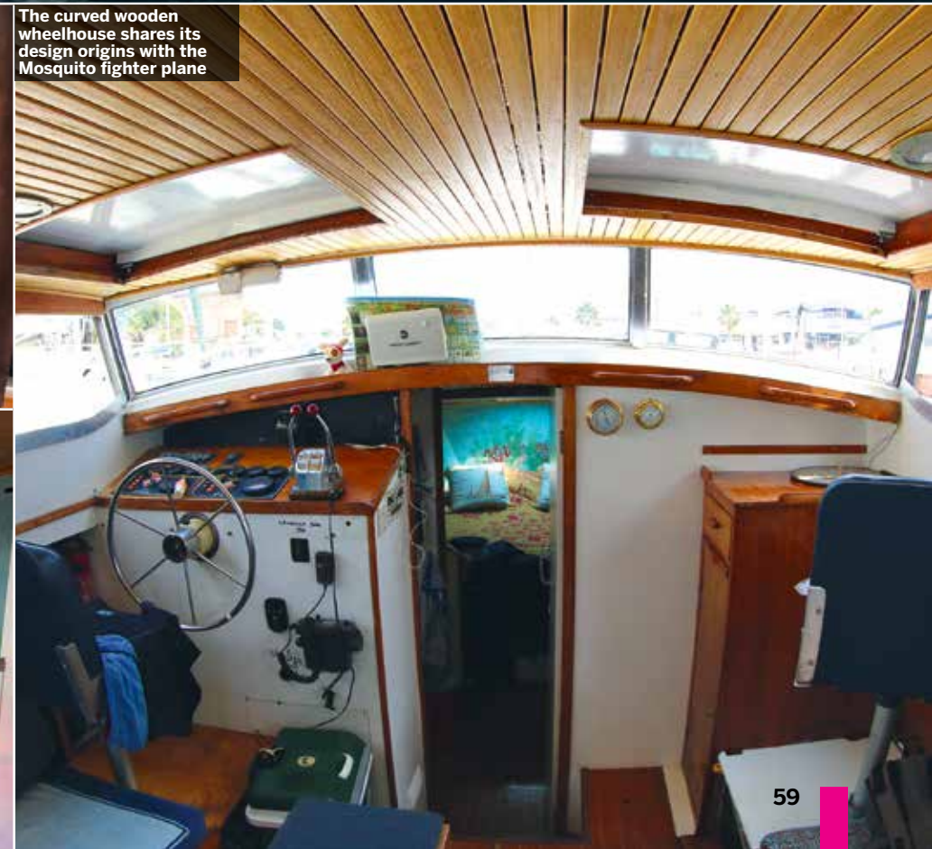
The curved wooden wheelhouse shares its design origins with the Mosquito fighter plane