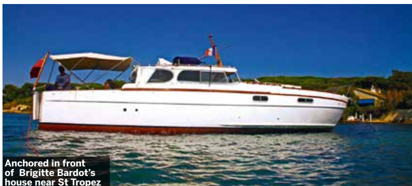
Anchored in front of Brigitte Bardot's house near St Tropez