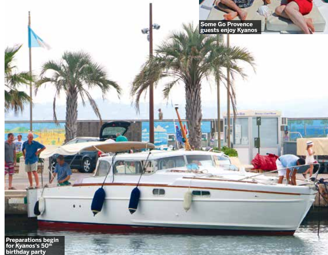
Preparations begin for Kyanos 's 50 th birthday party

in the Marina de la Bastille and sure enough they were waiting for me on arrival. I helped take her through the first two locks to show them the ropes, then climbed ashore, wished them bon voyage and caught the next plane back to London.